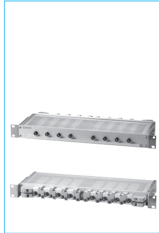
1U Compact Solution High Power

Two Power-D-Boxes, 1U 19" power distribution systems, for use with thermal high-performance circuit breakers type 482.