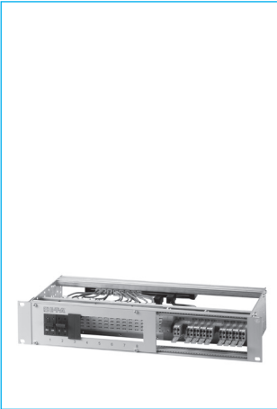
2U version with front terminals

The Power-D-Box is a 2U 19" power distribution system (also for ETSI systems), accommodating plug-in type double pole thermal-magnetic circuit breakers 2210-S with auxiliary contacts. All cable connections are on the front by means of feed-through terminals, partly pluggable.